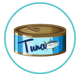
CANNED FISH AND MEAT