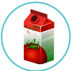
100% FRUIT JUICES