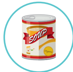
SOUPS OR STEWES