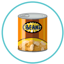
CANNED BEANS & VEGETABLES